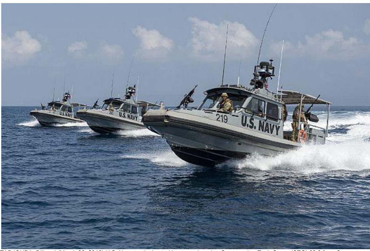
TADJOURA, Djibouti (March 30, 2019) U.S. Navy tactical patrol boats assigned to Commander, Task Group (CTG) 68.6 from Camp Lemonnier, provide security to the Military Sealift Command fleet replenishment oiler USNS Tippecanoe (T-AO 199) as it departs the Port of Djibouti, March 30, 2019. Camp Lemonnier is an operational installation that enables U.S., allied and partner nation forces to be where and when they are needed to ensure security in Europe, Africa and Southwest Asia.

vaccinated against when they join a branch of service. The Navy, in an abundance of caution, also gave the more than 700 service members on board booster vaccinations for measles, mumps and rubella, the common triple-vaccine combination. The Fifth Fleet, however, noted that the mumps portion of that vaccine is the least effective, "providing 88 percent effectiveness after completion of the two dose series," it said in its statement to Business Insider. How this outbreak happened remains a mystery. "The point of origin has not yet been determined," the Fifth Fleet told the outlet. The Navy and Marines have launched an epidemiologic investigation into the outbreak; the investigation is still ongoing. The close quarters of Navy ships, of course, provide ample opportunities for infections to spread. How long the ship will remain at sea is also unknown, as the service will not consider the outbreak over until two incubation cycles have passed without a new infection. The mumps incubation cycle is 25 days, so it will be nearly two months at the very earliest before the USS Fort McHenry returns to shore.